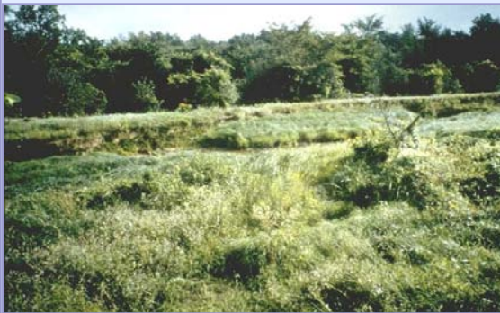
AFTER: PLUM CREEK ONE YEAR LATER LIVESTOCK REMOVED