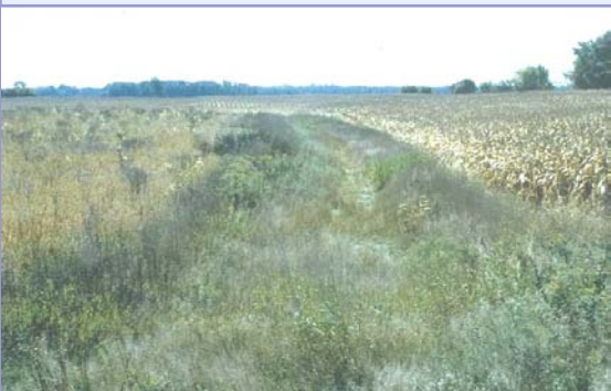
AFTER: ONE YEAR LATER. THE AVERAGE BUFFER WIDTH IS 35 FEET PER SIDE

riparian buffers. Riparian buffers are vegetated areas (at least 70% ground cover) adjacent to waterways that slow and filter water runoff as well as offering many other practical and aesthetic benefits (see below and Page Three for more).