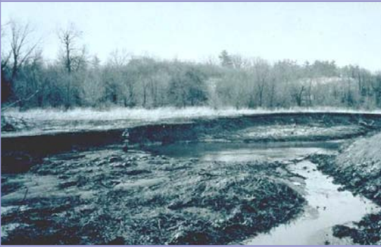
BEFORE: PLUM CREEK UNMANAGED PASTURE

Y c v g t " k u " Y k u e q p u k p ø u " o q u v " k o r q t v c p v " t g u q w t e g 0 " " C e e q t streams and 5.3 million acres of wetlands. We can help protect this critical resource and our water quality by installing