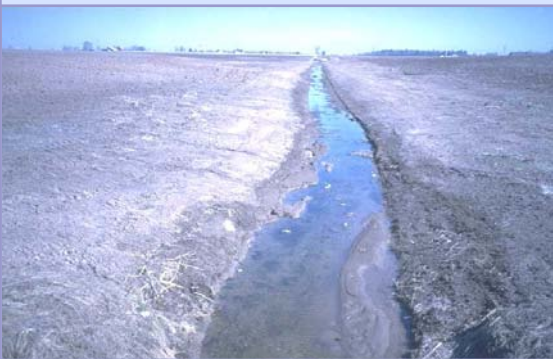
BEFORE: MANY LANDOWNERS PLOW THROUGH INTERMITTENT STREAMS